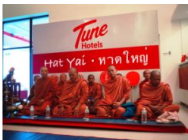
In line with Thai tradition, Buddhist monks performing prayers to bless the opening of Tune Hotel Hat Yai.

Tune Hotels is part of Tune Group, a lifestyle business conglomerate co-founded by Tan Sri Tony Fernandes