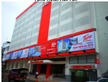
Tune Hotel Hat Yai located at Niphat Uthit 2 Road right at the heart of Hat Yai, Songkhla.